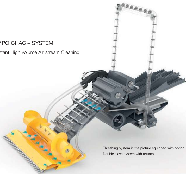
Threshing system in the picture equipped with option: Double sieve system with returns

Constant High volume Air stream Cleaning